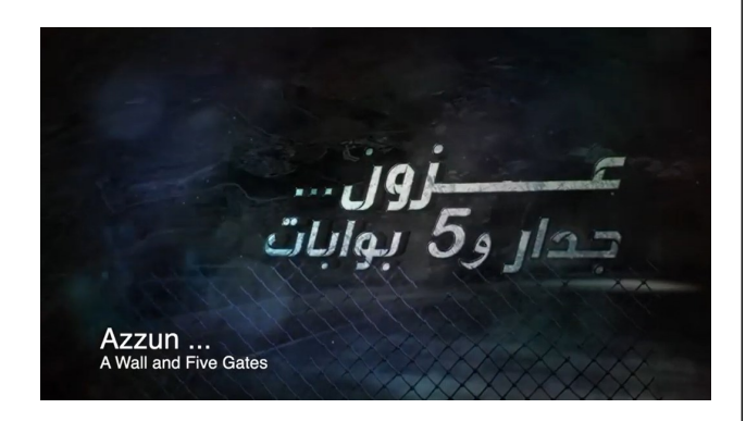
A Link to the film can be found here

On 18 February 2020, Addameer produced and published a short video about the human rights violations the Palestinian village of Azzun suffers from. This village is one of many Palestinian villages that are highly targeted by the Israeli occupation forces. The arrest, and night-raids rate is high and residents suffer from a number of violations that affects their daily lives.