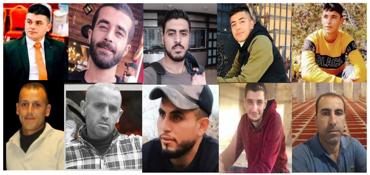
The pictures and names of the ten Palestinians killed near Beita between May 2021 and May 2022

against the Evyatar colonial outpost, and the tenth was a plumber, killed as he was trying to raise the water level at a well to circumvent water shortage on Beita.