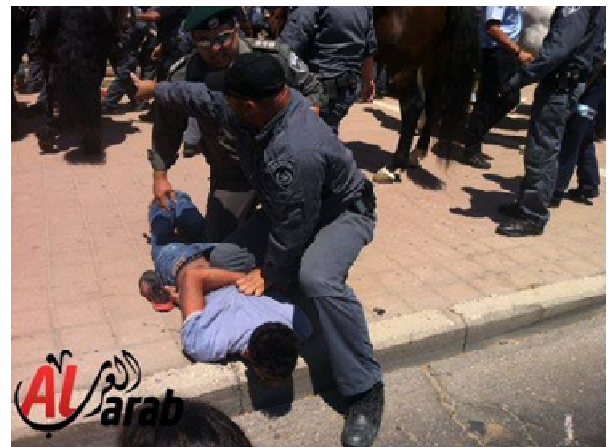
Israeli police arrest demonstrator at the Praver Plan protests on 15 July 2013.

In the early hours of the morning on 17 July 2013, Special Forces raided Aysheh Prison and attacked the prisoners. Ultimately, they put four prisoners in isolation and injured dozens. Similarly on 29 July 2013, cell 11 in Askalan Prison was raided in the middle of the night, and the prisoners were corralled into the prison yard as the special forces raided and ransacked their cells. The prisoners reported that the special forces were armed and carried gas canisters.