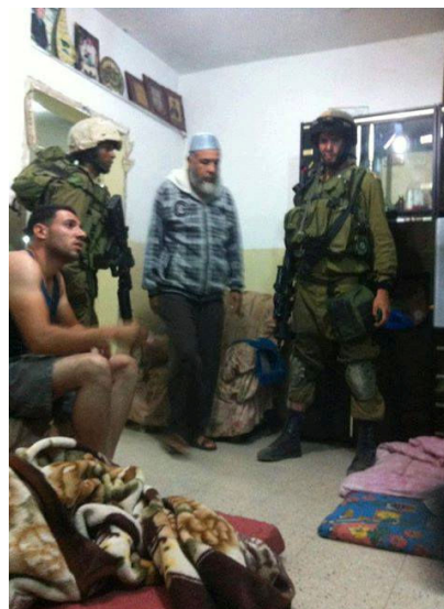
Photo of a home raid on 2 July 2013 in Jalazone Refugee Camp near Ramallah.