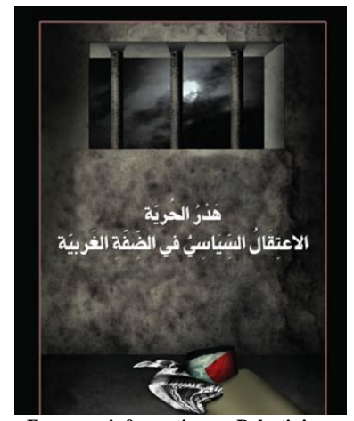
For more information on Palestinians held in PA prisons and detention centers, see Addameer's most recent annual report on the subject (January 2009 – September 2010)

Currently, there are approximately 200 political prisoners in the prisons and detention centers of the Palestinian Authority in the West Bank. These detainees are mostly affiliated with Hamas but also include individuals from Islamic Jihad, Hizb al-Tahrir and the Popular Front for the Liberation of Palestine. In the Gaza Strip,