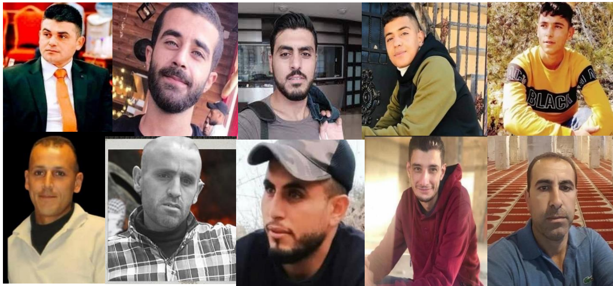
The pictures and names of the ten Palestinians killed near Beita between May 2021 and May 2022

against the Evyatar colonial outpost, and the tenth was a plumber, killed as he was trying to raise the water level at a well to circumvent water shortage on Beita.